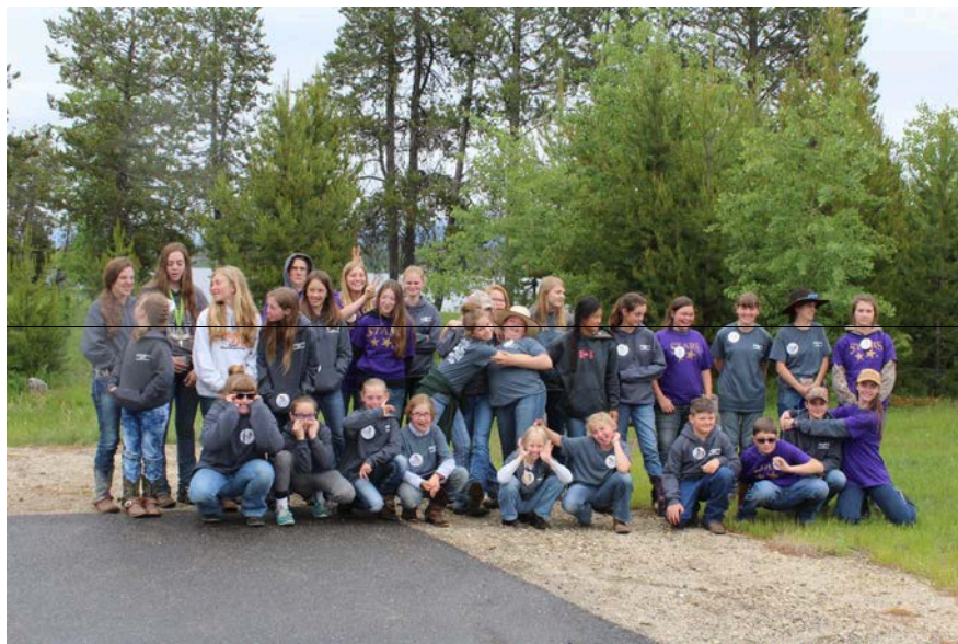
Participants at the 2017 Southern District Horse Camp

Depart from Camp: Sunday, June 17, by 1:00 p.m. Breakfast & Lunch will be served this day.