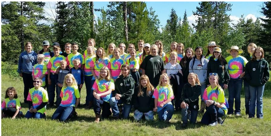
Participants at the 2016 District II Horse Camp